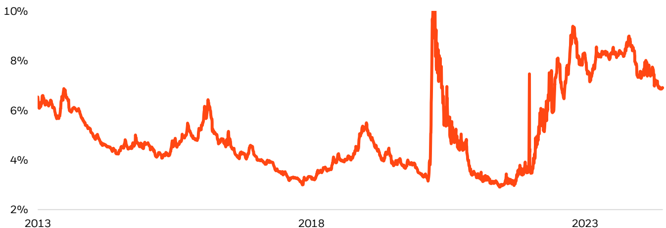
Figure 1: European high yield is currently yielding levels that we have rarely seen in the last 10 years

Graph shows historical yield to worst of the Bloomberg Pan-European HY 3% Issuer Constrained Index Hedged to EUR.