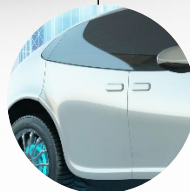
Recycled plastic body by E360S