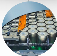
Battery: efficiency by Group14 manufacturing by Northvolt materials and recycling by Ascend Elements