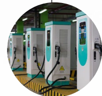
Pan-European charging network by Ionity