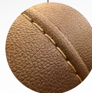
Mycelium leather upholstery by MycoWorks