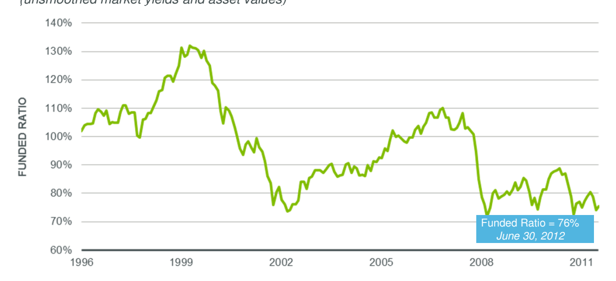
Figure 1: Funded ratio of a typical US corporate defined benefit pension plan (unsmoothed market yields and asset values)