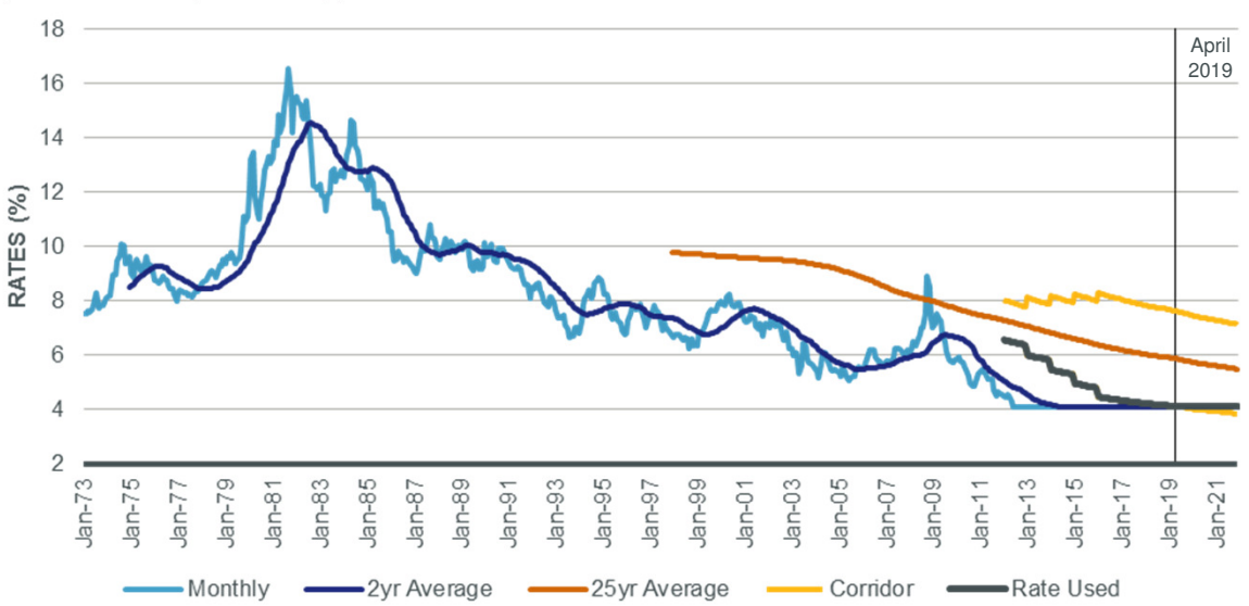
Figure 2: Implementation of Pension Funding Stabilization – Tier-2 Segment Rate (liabilities 5-20 years away)

Source: BarCap, IRS, BlackRock. Dates: January 1973-June 2012.